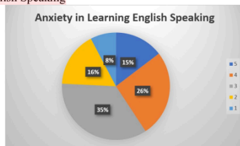
Figure 3. Anxiety in Learning English Speaking Chart

From the graphic data above (Figure 3), it can be seen that the one that gets the most number of choices is gray with code number 3 with a value of 35%. In other words, the other numbers (1st, 2nd and 5th) have slightly the same average of around 8% to 16%. Meanwhile, some students chose 26% with the 4th number that the obstacles in learning English affected them. Therefore, it can be said that Anxiety in Learning English Speaking has a low effect on anxiety in speaking English. Therefore, it can be said that Anxiety in Learning English Speaking has a low effect on anxiety in speaking English.