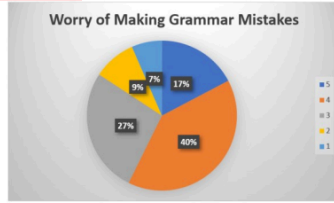
Figure 2. Worry of Making Grammar Mistakes Chart

From the graphic data above (Figure 2), it can be seen that the highest score obtained was the brown choice with a total of 40% with code number 4, but the other choices also had quite a large number, namely 27% with code number 3 and the blue option is 17% (code number 5). Thus, it can also be concluded that the Worry of Making Grammar Mistakes factor has the greatest influence on anxiety in speaking English.