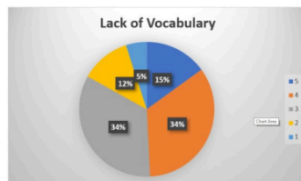
Figure 1. Lack of Vocabulary Chart